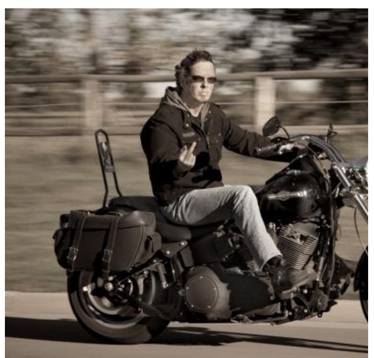
Hey, that's not the wave! The photographer must ride a sport bike.

of waving at hundreds of other riders make that a little difficult.