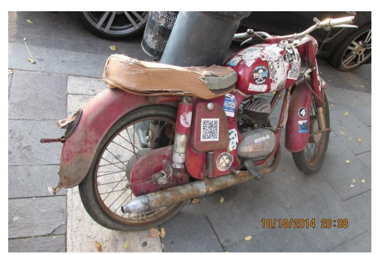
A good rental bike like this is just darn hard to find when you are traveling.