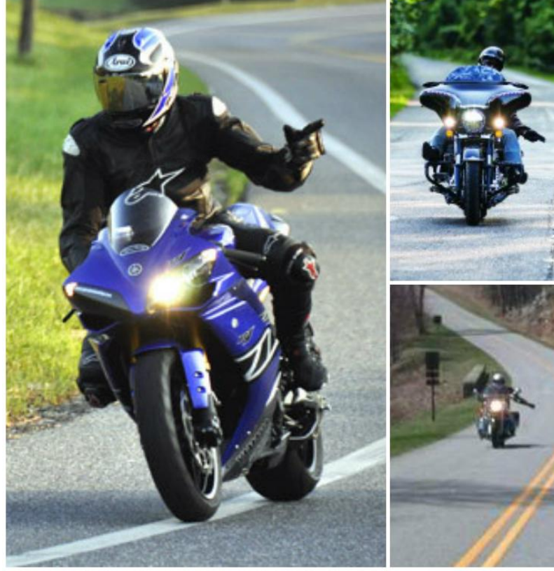
All these waves are perfectly fine; but it's not always this simple!