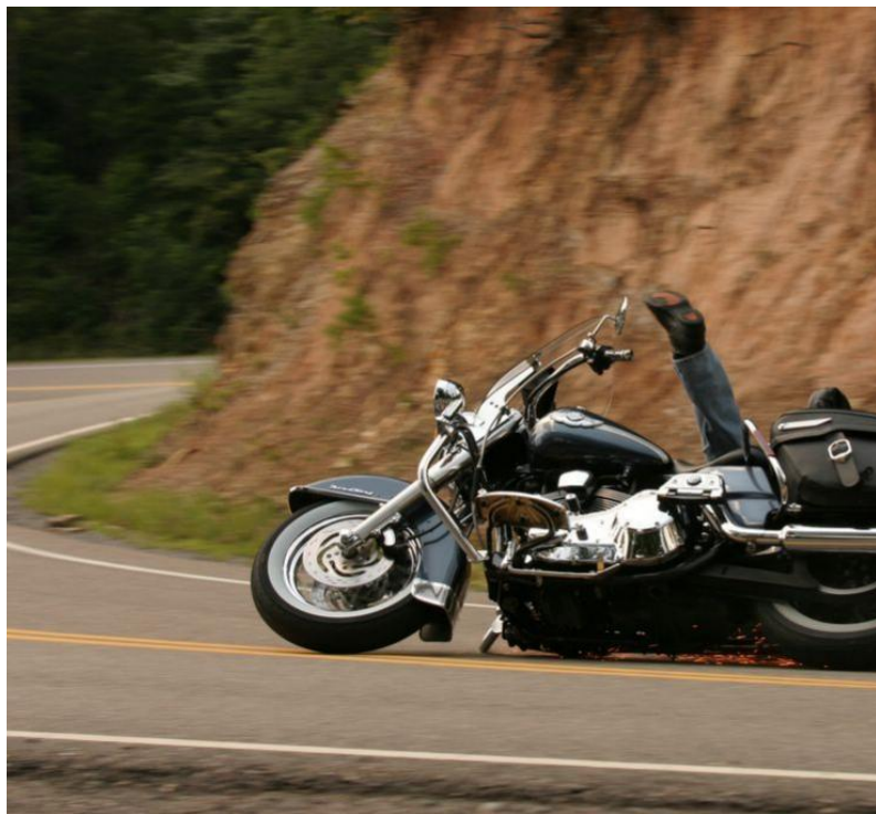
I've heard of the leg wave, but I don't think that's how you do it!

rather look like a snob and get through it in one piece, than be the friendly guy that got T-boned because I didn't notice a car running a red light (but that's just me.)