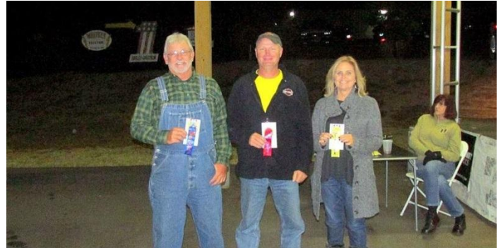
Chili Cook-Off – SC Whole HOG Chili Cook-off is scheduled for January 24<sup>th</sup> at Low Country Harley Davidson.