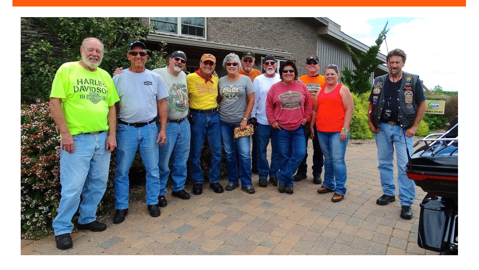
Chattooga Belle Farms --- Long Creek, SC