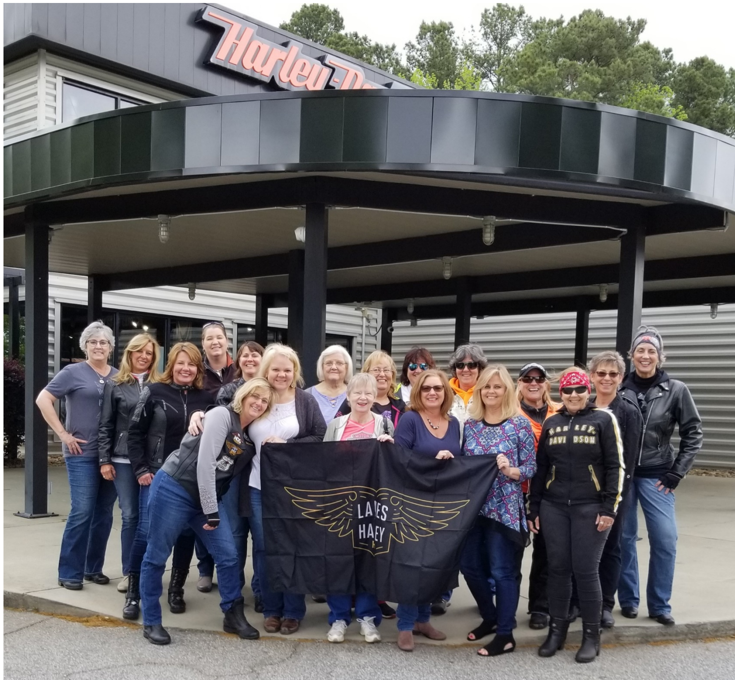
A few of our Ladies of Harley