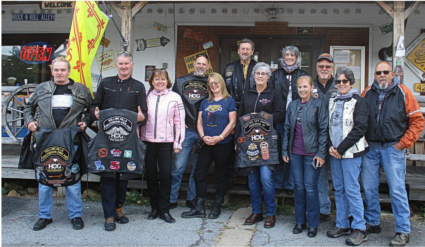
Rolling Hills Chapter from Cheltenham England enjoying the Hills and Hollers Rally with us!